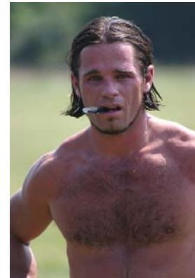
How can you not vote for this dreamboat?

the club's securing of a license to conduct a 50/50 raffle at events, as well as a commitment to make tournament ad-book sales available in the spring, rather than the summer in order to give people an early start on obtaining sponsors.